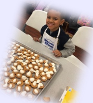
Kids LOVE to help cook!