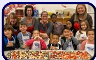
Kids REALLY LOVE to eat what they help cook!