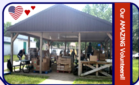
Our AMAZING Volunteers!!