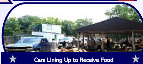
Cars Lining Up to Receive Food

Coming soon to Firetree Place! Commodity Supplement Food Program (CSFP) is a program that works to improve the health of low income persons age 60 years and older by providing nutritious USDA foods. Keep your eye out on Firetree Place's website and/or our Facebook page for updates!