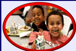
Kids LOVE to eat!

FIRETREE PLACE QUARTERLY NEWSLETTER: APRIL-JUNE 2021